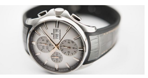
<span lang="EN-US">The case, pusher and screw-down crown of the Meister S Chronoscope Platinum Edition 160 are made of polished platinum PT950 - the most precious metal in the world. The edition engraving and the limitation number on the watch back and the hour counter of the stopwatch make each of the only twelve timepieces available unique.