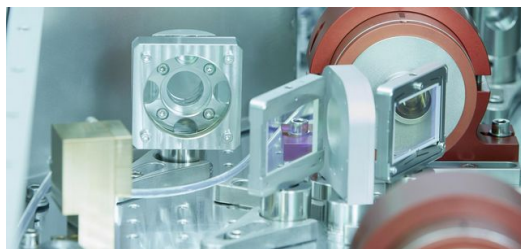
Optics for laser amplifier in science.

Ultimately there's one key thing that any potential entrepreneur needs to remember: if you're looking for an idea that amounts to more than just lines of code, you would be wise to take a careful look at what lasers can do. Or think carefully about what people who work with lasers need. Or at least mull over what lasers can do to help people who are planning something new – or who are simply looking to save the world.