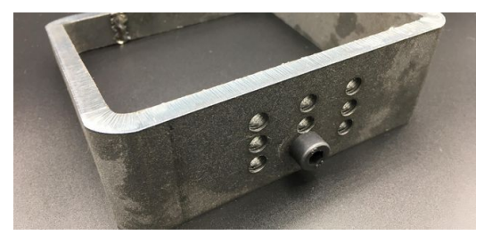
The TruLaser Tube 7000 can be used to fabricate a range of different threads in tubes.

Since the summer of 2017, the company's plant in the Swabian Jura region has been using a test unit of the TruLaser Tube 7000 laser tube cutting machine with integrated tapping system. "We are delighted to be working with TRUMPF on this kind of collaborative project, and we are certainly impressed with the new technology," says Frank Steinhart. The CO2 laser cuts tubes and profiles without leaving burrs and offers bevel cuts of up to 45 degrees, diameters up to 254 millimeters and wall thicknesses of between one and ten millimeters.