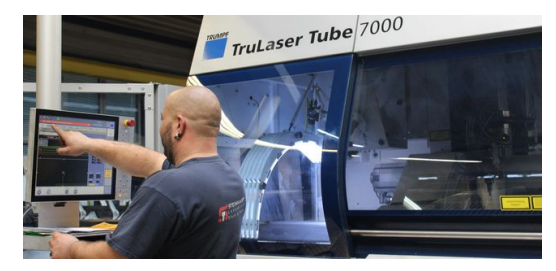
The finished program appears on the machine operator's terminal.