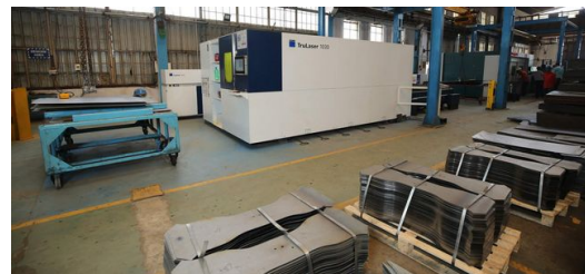
JBM has been using the TruLaser 1030 laser machines for sheet metal cutting for several years.