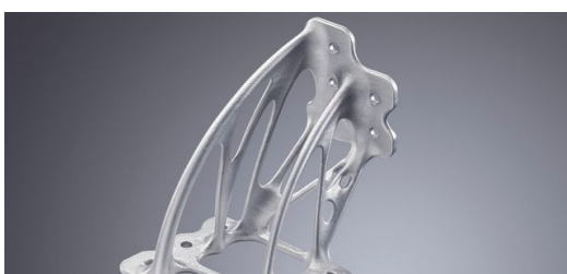
Lightweight construction: Weight reduced mounting brackets are

We started working on selectively fusing metals, what we now call Laser Metal Fusion (LMF), in 1999 together with the Fraunhofer ILT. We used the experience we gained from this to develop our first LMF machine—the TrumaForm. The machine was introduced to the market in 2003, which was pretty early in the game for industrial additive manufacturing solutions. Unfortunately, it was a bit ahead of its time. The market was still heavily focused on research and development applications, as well as a few niche applications, so we set further development aside for the time being.