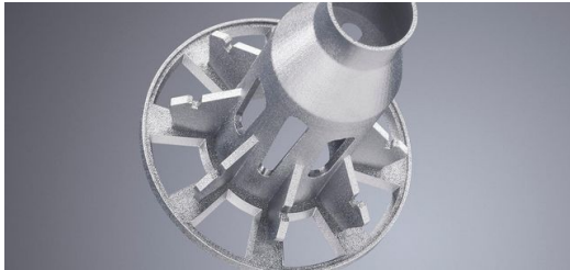
Prototype: The impeller component is a prototype from the Powertrain Development Department. This component geometry was tested by Volkswagen AG to optimize flow behavior within the motor.

particularly beneficial in aircraft construction. Here material is only accumulated along lines of force transmission.