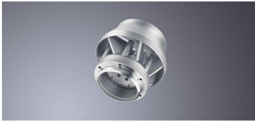
Flexibility: Additive manufacturing enables the flexible production of components without using tools.