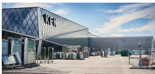
<p>The KFK building in Croatia.</p>