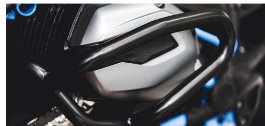
<p>IBEX aims to make everything people need for their motorcycles out of sheet metal. These crash bars are just one example of what the company offers.</p> – Marlen Mieth