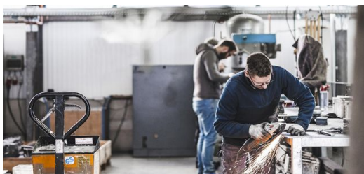
<p>In 2015 IBEX moved into a 2,300 square meter production hall with an attached office in Dresden.</p> – Marlen Mieth