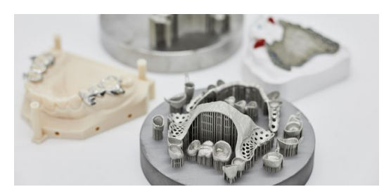
>Dentures from the TruPrint 1000 3D printer from TRUMPF.<br />

For example, instead of relying on impression trays, CADSPEED offers its clients the use of so-called intra-oral dental scanners. These are manual scanners equipped with sensor systems, which dentists can use to digitally map the patient's mouth in 3D. This data can then be processed further directly, negating the need for a plaster cast. As a result, the whole process is faster, more affordable, and more precise.