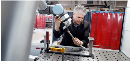
<p><span lang="EN-US">The TruArc Weld 1000 is the entry into simple welding for the company zweifel metall ag.</span></p>