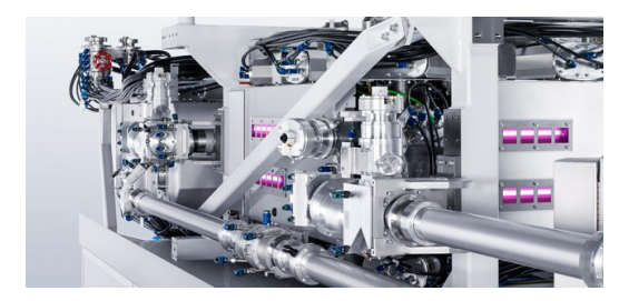
The excited mixture of gases in the CO2 laser glows red – this is where the high performance laser beam is produced.