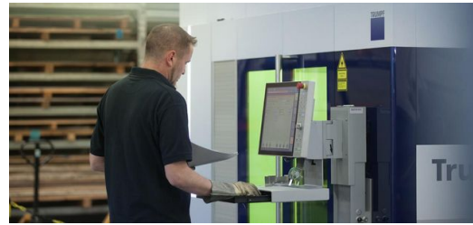
They program their TruLaser using TruTops Boost software, which makes generating production schedules a breeze.