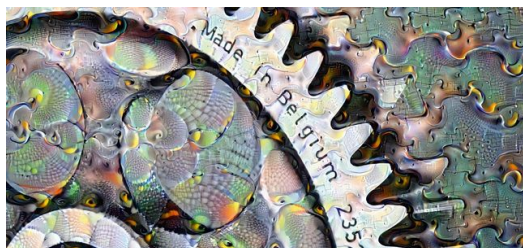
<p>The dream in the workpiece?</p>