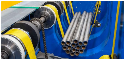
TruLaser Tube 7000