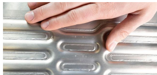
In the folding-box concept developed by BENTELER for a stainless steel battery housing, the patented TRUMPF solution BrightLine Weld ensures spatter-free processing and high-strength gas- and helium-tight weld seams, even in rapid series production.