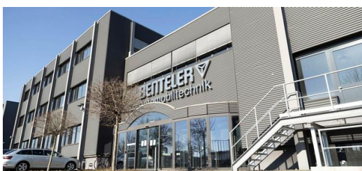
BENTELER is a fourth-generation family business, with headquarters in Paderborn, Germany. In its Automotive Division, this metal process specialist develops, produces and sells safety-relevant products, systems and services for the automotive industry.