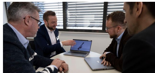
The MultiFocus optics developed by TRUMPF especially for BENTELER produce outstanding results in the pore-free, gas-tight welding of aluminum in combination with BrightLine Weld.