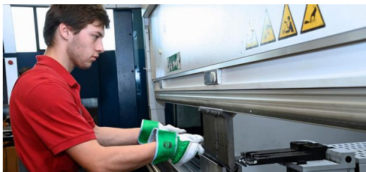
<p><span lang="EN-US">Assistance systems and software help with the work: The TruBend 5230 in use at the Fischer company.</span></p>

Until Fischer came across TecZone Bend . The TRUMPF program simulates bends in 3D and automatically checks feasibility. "Fascinating!" exclaimed Fischer. "We immediately said, ok, we need that!" However, it also quickly became clear that "to take full advantage of the program, we'd need a TRUMPF press brake to do it." Fischer then invested in the TruBend 5230 - and has not regretted it. The three options - Part Indicator, ACB Laser and ACB Wireless – all played a decisive role here.