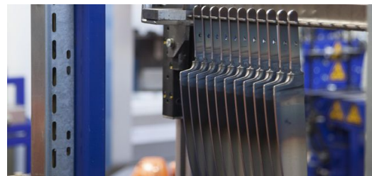
Following contour cutting, the blades wait for pins to be fitted and then go for grinding and hardening.