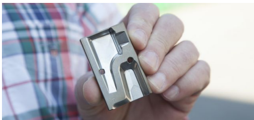
The molded gripper forces the blanks into a defined position, aligning them with the laser machine’s reference system.