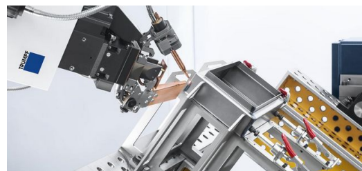
The FusionLine joining technique can be used to join parts, even when this involves the bridging of gaps. It smooths out any unevenness during the welding process and closes gaps up to one millimeter wide. That makes it possible to use the laser on many parts that were originally designed for conventional welding methods.