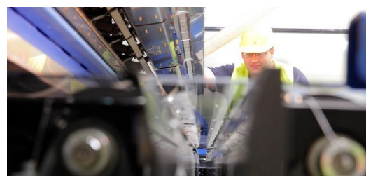
Strahlfallen befinden sich oberhalb und unterhalb der Laserlinie.