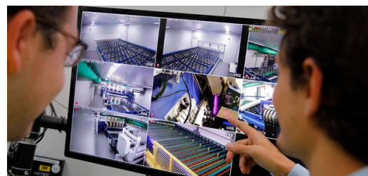
Heating the glass coating very briefly to a high temperature is an essential part of the hardening process. The glass experts at Saint-Gobain spent five years working on their rapid thermal processing method.