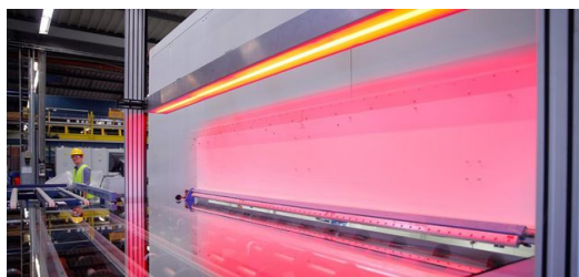
An ultrathin laser line — thinner than 100 micrometers — briefly heats the functional coating on sheets of glass to over 500 degrees.

Lorenzo Canova, RTP project leader at Saint-Gobain Glass Germany, says: "We were sure that a short, high burst of heat that heats only the coating and not the glass substrate can be accomplished only using a laser with high efficiency." The glass specialists developed a laboratory facility with a complex laser unit as its centerpiece. Using rapid thermal processing, they created a procedure that enabled them to verify their chosen approach. So far, so good.