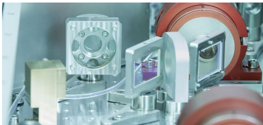
<div class="indent">Optics for laser amplifier in science. </div>

Ultimately there's one key thing that any potential entrepreneur needs to remember: if you're looking for an idea that amounts to more than just lines of code, you would be wise to take a careful look at what lasers can do. Or think carefully about what people who work with lasers need. Or at least mull over what lasers can do to help people who are planning something new – or who are simply looking to save the world.