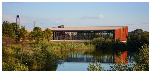
Chicago was consciously chosen as the location for the Smart Factory. The directly adjacent states contain around 40 percent of the country's entire sheet metal working industry.

When a working factory is set up in a showroom, manufacturing processes come alive. Once again, TRUMPF has gone to extraordinary lengths not only by creating a hands-on experience of connected production but also by framing it in a futuristic vision that offers revolutionary perspectives. A control room equipped with numerous monitors, many of them transparent, looks directly out over the shop floor and all the machinery. And an elevated walkway spanning the entire production hall provides a bird's-eye view of the digitally connected facility. TRUMPF's smart factory in Chicago shows the modern face of sheet metalworking using the latest tools. Unlike other demonstration centers which focus on individual products, here visitors can see the fully orchestrated interaction between elements in the production system. The Chicago demo center enables customers to visualize their entire value chain and even simulate their own job schedules.