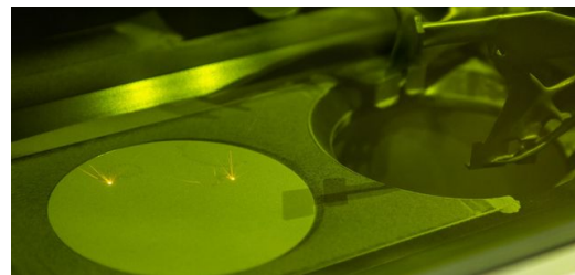
The pulsed laser in TRUMPF's TruPrint 1000 is an excellent choice for creating high-quality surfaces. Its multi-laser capabilities enable highly productive manufacturing processes.