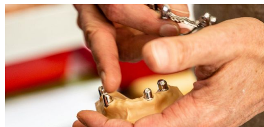
The primary coping (bottom) is cemented to the existing, prepped tooth stumps. The secondary crown, or female part, is connected to splints for the replacement teeth and placed on the primary coping.