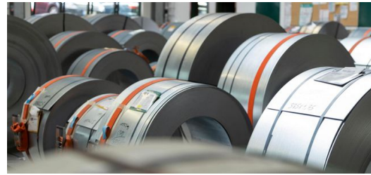
A new coil warehouse is also being built at the SCHRAG site in Seevetal, and it will supply material to both the roll-forming line and the press line.