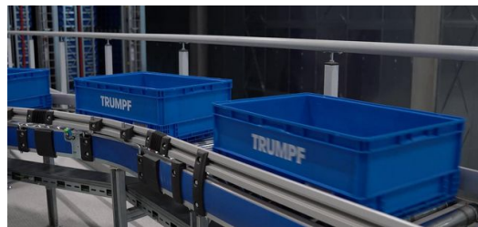
The first few meters on route to the customer: plastic bins contain up to four insert boxes for small parts.