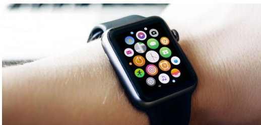
Smart watches are another intelligent companion.

Not only does this new cutting technique give manufacturers the opportunity to dispense with expensive intermediate steps in today's industrial display screen manufacturing processes. It also allows the process to be reorganized. Because the laser cuts hardened glass quickly and without touch-up work, the future could see processing steps such as hardening, coating and structuring being carried out at a greater scale, on large panels. Lasers could then cut the large panel into smaller sections at the very end of the process.