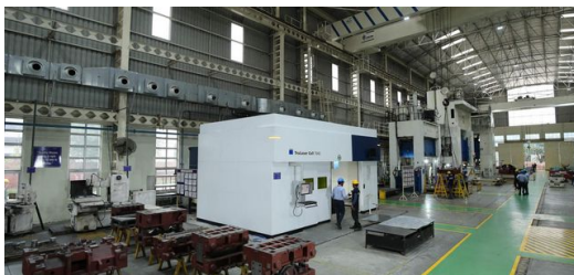
Originally bought for prototyping, JBM is using the TruLaser Cell 7040 now to process parts made of high strength steel.