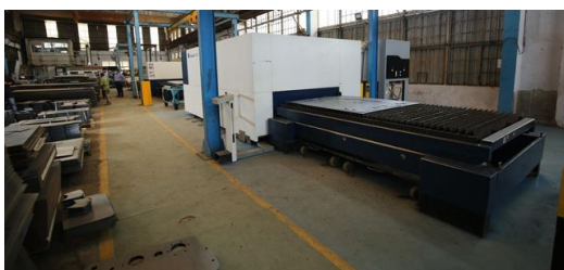
Lightweight doesn't always need high strength steels: JBM uses this TruLaser 1030 to produce profiles for buses.