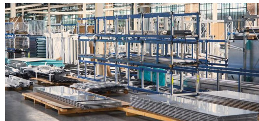
<p>A one-stop service provider: KFK set up its own glass production facility measuring approximately 360 meters long in 2017.</p>