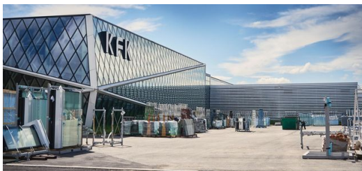
<p>The KFK building in Croatia.</p>

KFK used to focus predominantly on customers from Croatia, but today the company is involved in projects all over the world. "Right now we're focusing on the UK, which is currently experiencing a boom in construction. All the world's big cities are constantly striving to make buildings that are taller, more sophisticated and even better quality, and London is no exception," says Papac. He is particularly proud of the biggest project KFK is working on at the moment: "It's a residential building in London, the tallest structure of its kind currently under construction anywhere in Europe. With 76 floors and at 233 meters tall, it's a project that obviously requires the production of lots and lots of facade modules." It takes several years to complete projects on this scale – three and a half years in this case.