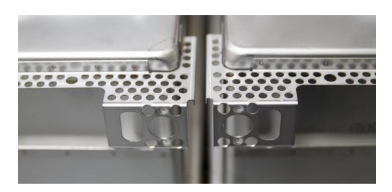
Formed areas – like brackets, threads and hinges – are now made up quickly and easily on the TruMatic 6000 fiber.