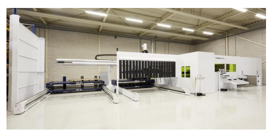
"Automating our machines eases the work for the employees. Instead of tedious and troublesome loading and unloading operations, they can devote their attention to other tasks during production operations," Sander Mutsaers explains.

"Even after this short period in use we have been able to reduce by 40 percent the time needed to manufacture the front panel of a pay-and-display machine, made of aluminum and stainless steel. The separate working phase at the press brake for small bendings is eliminated because the new punch laser cutting machine already takes care of the necessary bends," he tells us. Formed areas – like brackets, threads and hinges – are now made up quickly and easily on the TruMatic 6000 fiber. Four TRUMPF press brakes are used when processing larger parts and assemblies.