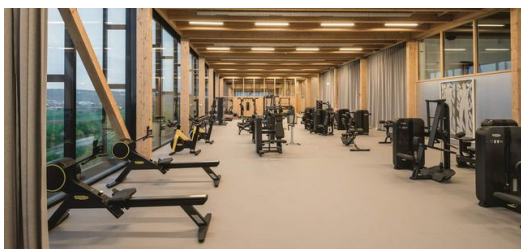
Fitness center: How's the rush hour looking on the highway? The fitness center in Ditzingen is the perfect place to check for traffic jams.