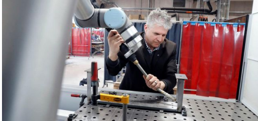
<p><span lang="EN-US">The TruArc Weld 1000 is the entry into simple welding for the company zweifel metall ag.</span></p>