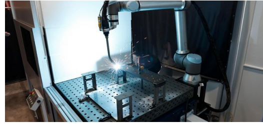
<p><span lang="EN-US">The automated welding cell that is easy to program, has many parameters already integrated and at the same time meets high quality standards: the TruArcWeld 1000 from TRUMPF.</span></p>