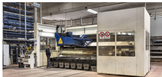
Multi-talented: ELFIM does not just use the Laser cell 1005 to weld and cut 2D and 3D components. The system is also suitable for laser metal deposition.