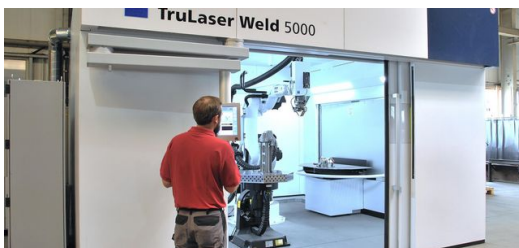
Significant savings: sheet metal fabricator Schink operates its TruLaser Weld 5000 laser welding cell and TruLaser 3040 laser cutting machine in what's known as a laser network. That means the two systems share a 4-kilowatt TruDisk 4001 solid-state laser source.

The Schink sheet metal experts point to the example of the flour duster to illustrate the dimensions of the productivity gains they have achieved. Welding the housing by hand takes about 110 minutes, including some laborious preparations and various finishing steps. With the TruLaser Weld 5000, Schink has introduced a reliable process that gets the same job done in just 10 minutes, including set-up time – and with no finishing work required!