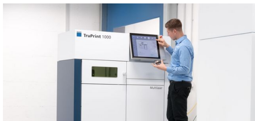
TruPrint 1000: TRUMPF's TruPrint 1000 3D printer