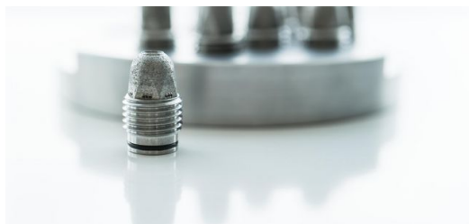
3D-optimized sewer cleaning system: This 3D-printed nozzle for sewer cleaning systems was optimized by TRUMPF.