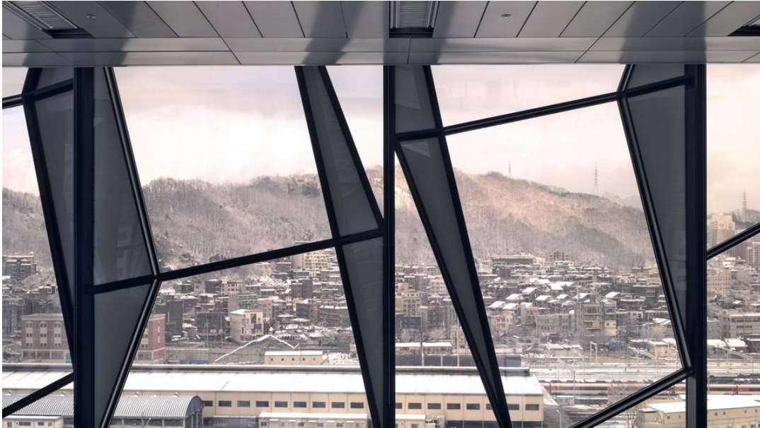
TRUTEC Building in Seoul, Korea.