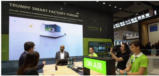
From consulting services to automation to fully digitally networked production - four TRUMPF experts answer questions from moderator Chris Brow.