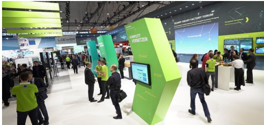
Thanks to the green T-shirts of the TruConnect consultants, visitors who had questions about the TRUMPF solutions for the Smart Factory quickly found what they were looking for.