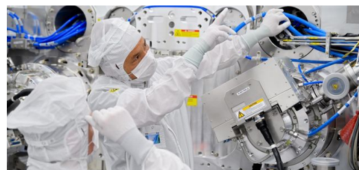
ASML employees in the clean room of the company in Veldhoven, Netherlands.