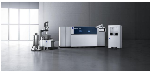
<p>How much automation does 3D printing need? Currently, rather large companies ask for complete automation solutions. Classic job shops prefer to operate the systems alone.</p>