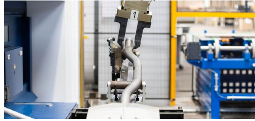
TruLaser Cell 8030