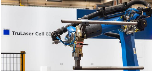
TruLaser Cell 8030