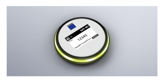
Marker: Users can transfer the order number and other information digitally onto the e-ink display of the marker. They can then simply place them on or beside the parts of the order.