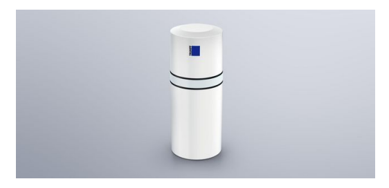
Satellite: Satellites installed in the production facility pick up the markers' location and transmit the information to an industrial PC.