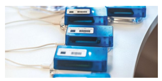
Prototype: What the markers looked like during the test phase.