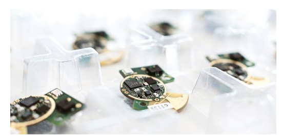
Ever smaller chips: A crucial part of the process.