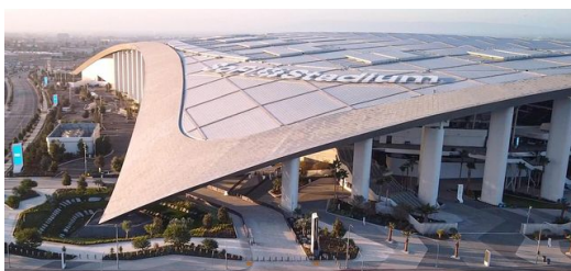
The roof of the SoFi Stadium is light and elegant. The cover made of the translucent plastic ETFE can be opened and closed.

Built at a cost of some 5 billion euros, the SoFi Stadium sports and entertainment complex near Los Angeles, with its event venues, parks and restaurants, is said to be the most expensive stadium in the world. The execution of the project was an extraordinary challenge for TRUMPF and its US customer, architectural engineering company A. Zahner. To build the SoFi, the Kansas City, Missouri-based metalwork experts used three TRUMPF machines to cut and punch 37,000 unique panels featuring some 30 million holes distributed at irregular intervals. This was made possible thanks to a customized software solution developed in Ditzingen.