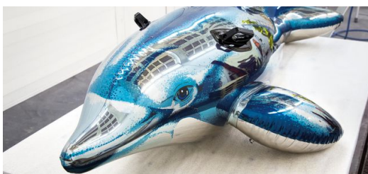
This dolphin will not be found in the water, but rather in a museum.

But of course! When the artist approves the objects we have created in our shop, he also offers a word of thanks to the staff involved. This personal recognition for their work is something they otherwise experience only very rarely. And I get goosebumps every time an artist sees his idea brought to fruition and — with a quiet "Wow!" — expresses his excitement. But actually, every customer who is satisfied with our work is a source of pride.