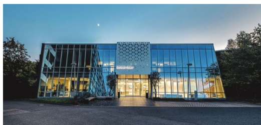
Customer center: TRUMPF impresses customers with its combination of outstanding industrial architecture and superb product quality.