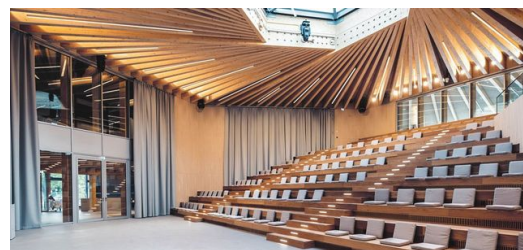
Flooded with light: To encourage listeners to engage with each other, the auditorium in the new training center features long rows of seating instead of chairs.