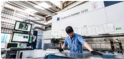
TruBend Center 5030 "Orisu"