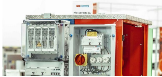
MERZ GmbH 2005 MERZ PCE