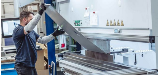
MERZ TRUMPF Oseon