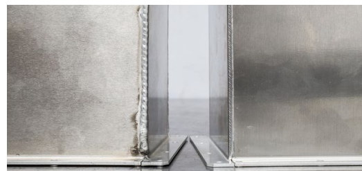
Werner Neumann's expectations in regard to the reduction in retouching work were satisfied completely by laser welding. For some parts the touch-up time could be reduced from twelve hours to just 90 minutes.