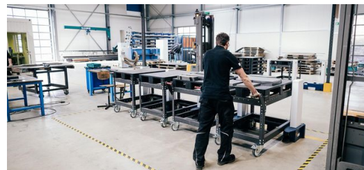
Sensors at the docking station detect when a pallet or pallet cage is parked and report this directly to TRUMPF's TruTops Fab software, which then takes over the automatic transport control.