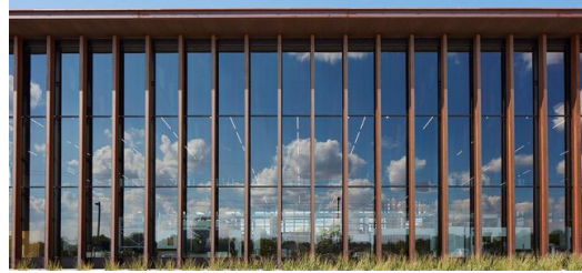
The focus of the Smart Factory is to advise and train customers on the introduction of digitally connected production solutions.