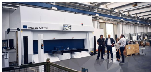
The TruLaser Cell 7040 in the production hall of Omas S.p.a.