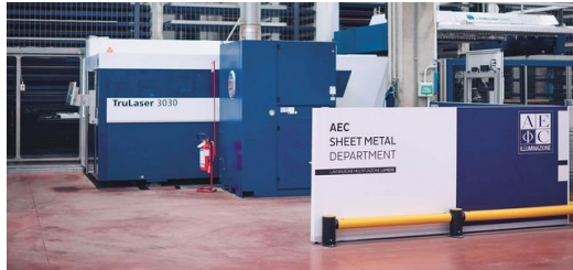
The TruLaser 3030 fiber 2D laser-cutting machine laid the foundations of AEC Illuminazione's close partnership with TRUMPF. Its connection to an automated storage system made production much faster.

achieve this, Bianchi has now connected up 85 percent of the company's machines. The MES generates production schedules and ensures smooth operation of the manufacturing environment. The design engineers can send their CAD drawings straight to the machines, where the data is imported and turned into finished parts as and when they are needed. The MES also collects machine data and key metrics for quality monitoring, machine utilization and production status. "By connecting everything together, we've created a truly transparent production environment. Tailoring our production schedules to the needs of our employees and machines helps to shorten throughput times and improve on-time delivery over the long-term," says Bianchi.