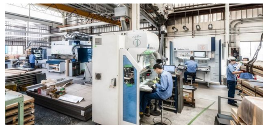
Various TRUMPF machines in KANEYOSHI's production hall ensure efficient manufacturing.