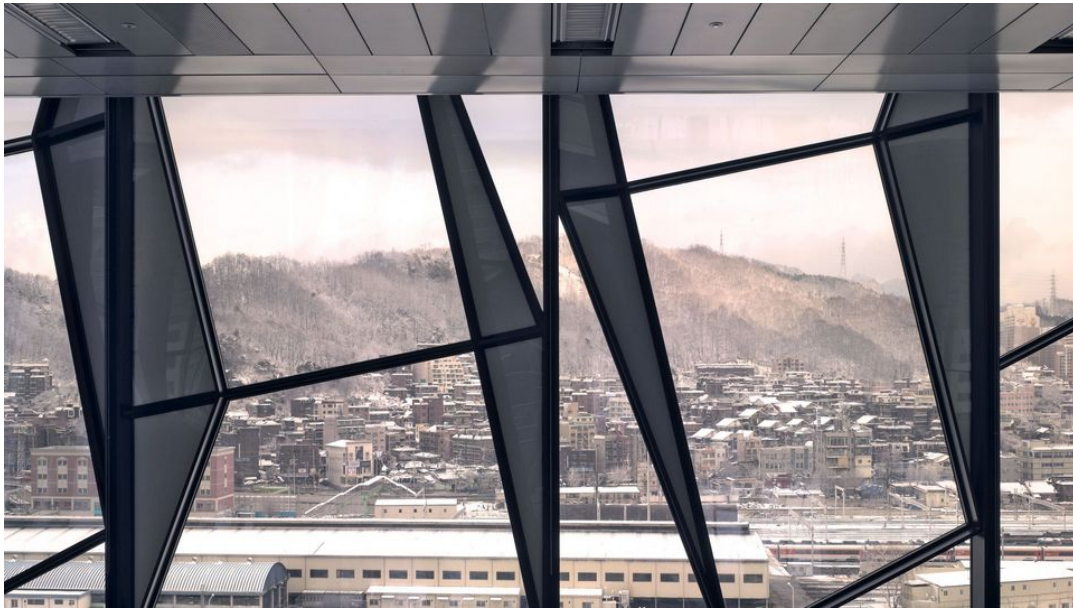
TRUTEK Building in Seoul, Korea.